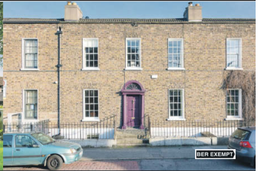
132 Ringsend Park, Ringsend, Dublin 4. Four-bedroom semi-detached house Asking price €850,000