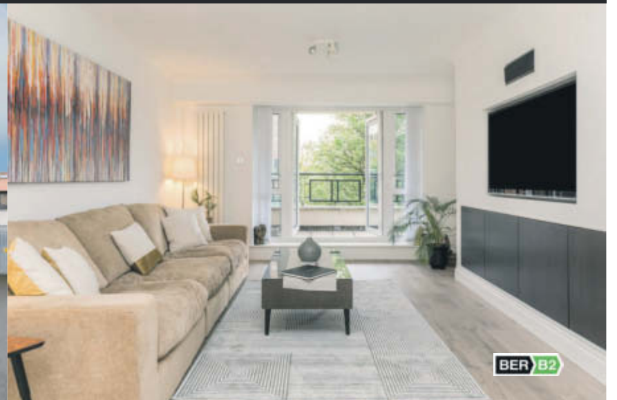
16 Rothe Abbey Court, Kilmainham, Dublin 8. Three/four-bedroom end of terrace house Asking price €550,000