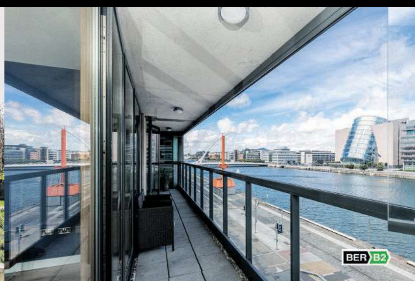
25 Hanover Riverside, Grand Canal Dock, Dublin 2. Superb two-bedroom apartment with water views. Asking price €610,000