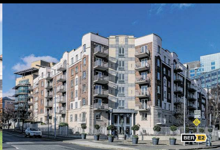
96 The Berkeley, Pembroke Square, Ballsbridge, Dublin 4. Attractive two-bedroom apartment with parking. Asking price €400,000