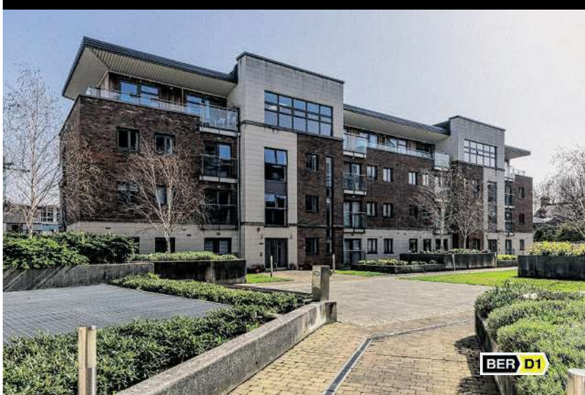
65/65A Hyde Square, South Circular Road, Kilmainham, Dublin 8. Two-bedroom apartment with separate studio/office. Asking price €385,000