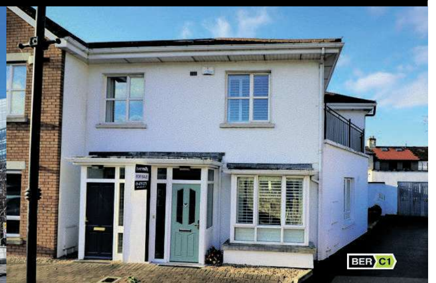
16 Rothe Abbey Court, Kilmainham, Dublin 8. 3/4-bedroom house with south facing garden. Asking price €550,000