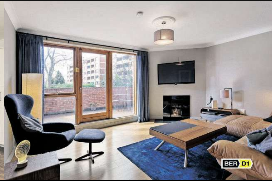
30 Mount Sandford, Milltown, Dublin 6. Three-bedroom duplex with south facing terrace. Asking price €550,000