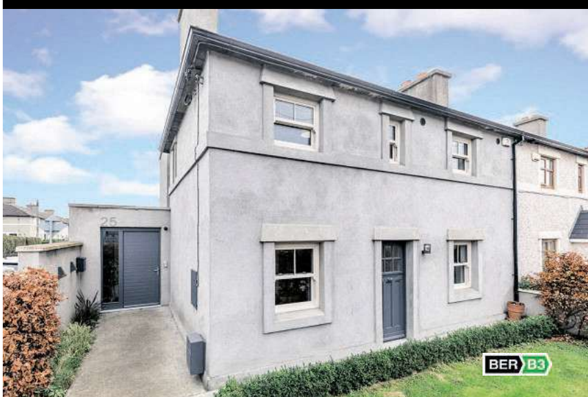
25 West Road, East Wall, Dublin 3. Renovated and extended three-bedroom house. Asking price €575,000