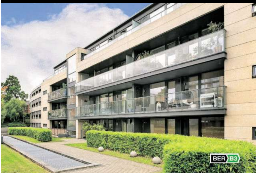
1 Maple Hall, Mount St. Anne's, Milltown, Dublin 6. Two-bedroom apartment, with two parking spaces. Asking price €485,000