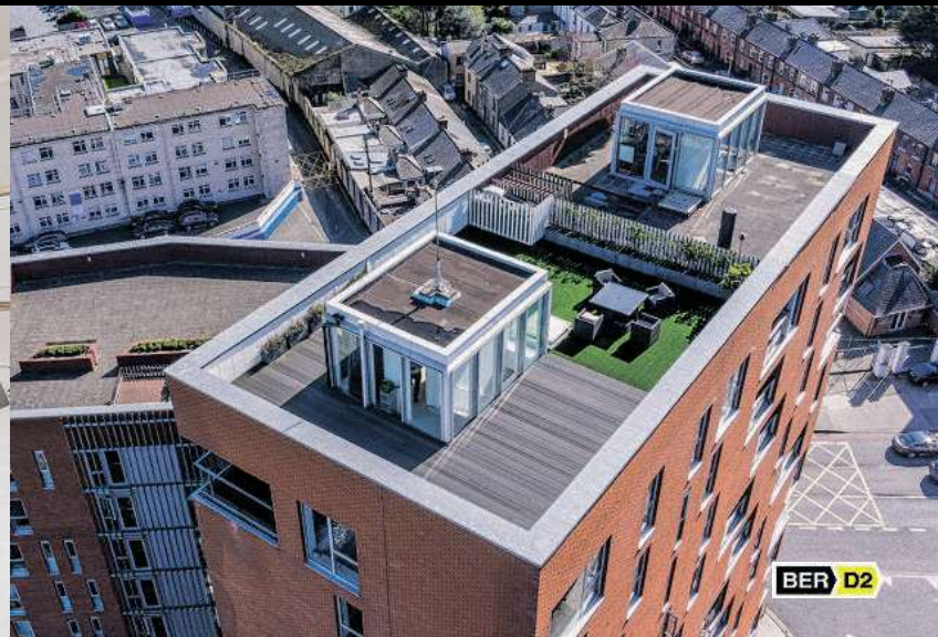
69 Earls Court, Reuben Street, Dublin 8. 11th & 12th floor three-bedroom penthouse. Asking price €495,000