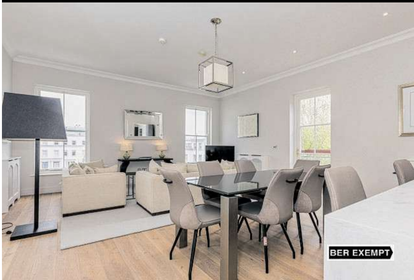
6 Northfield, Bloomfield House, Donnybrook, Dublin 4. New, top floor, luxury two-bedroom apartment. Asking price €900,000