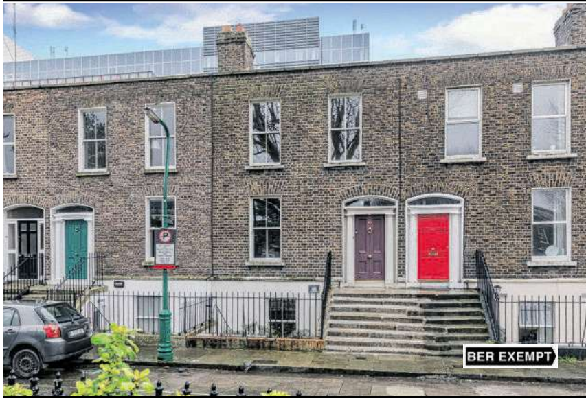
45 Pearse Square, Dublin 2. Three-bedroom period house with rear access. Asking price €1,100,000