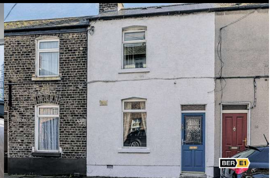
38 Eblana Villas, Off Grand Canal Street Lower, Dublin 2. Two-bedroom, three-bathroom townhouse. Asking price €390,000