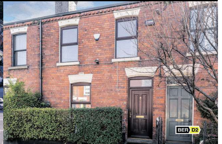
22 Reuben Avenue, Rialto, Dublin 8. Three-bedroom period house with attic space. Asking price €405,000