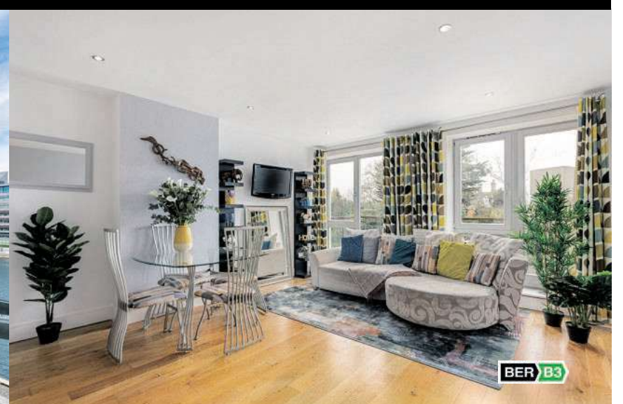
25 Southmede, Dundrum, Dublin 16. Dual aspect, south facing, two-bedroom apartment. Asking price €450,000

View virtually and make offers @ owenreilly.ie