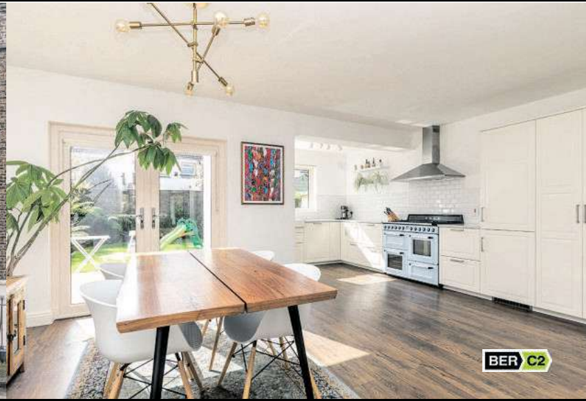
110 Longwood Park, Rathfarnham, Dublin 14. Four-bedroom house with south facing garden. Asking price €595,000