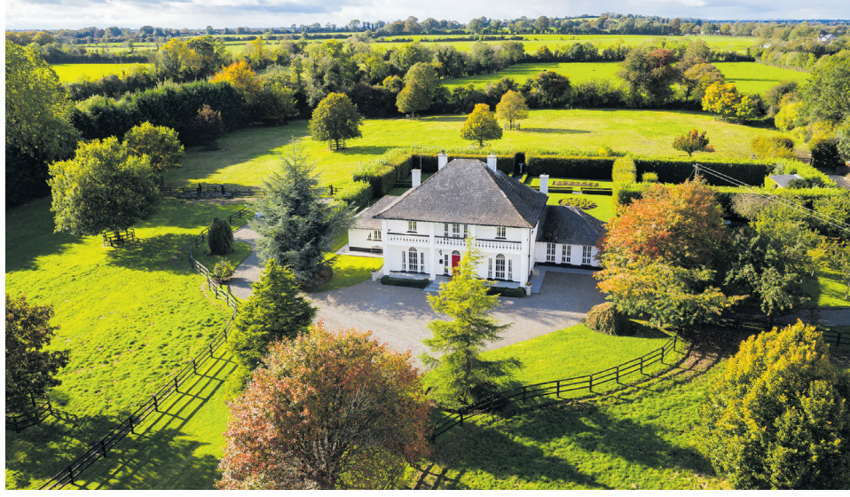
Ochan in Durhamstown in Navan, Co Meath: a striking residence built in the Palladian style in the mid-1970s, is surrounded by 8.7 acres of grounds with three paddocks and excellent grazing lands

lots of entertaining, thanks to the easy flow of the internal layout." Shortly after moving in, the owner converted the double garage into a granny flat for his late mother, which he now uses as his private office while working