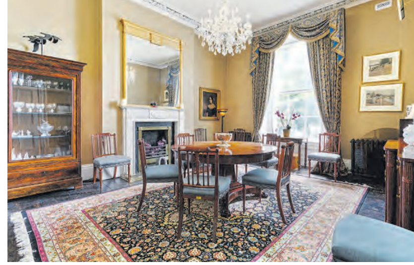
Main image: 42 Leeson Street Upper, Dublin 2; above: the elegant dining room; below: the drawing room overlooks the front garden through two sash windows