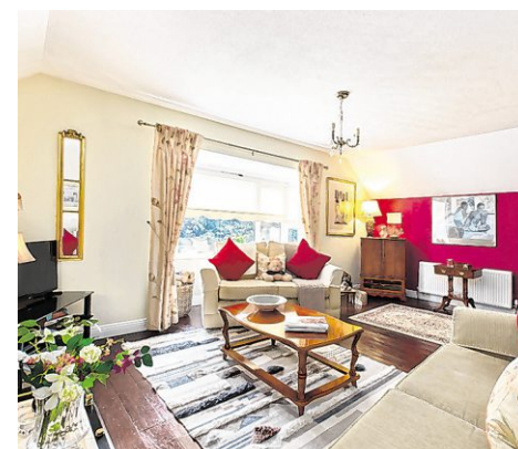
1 Chestnut Glen has garden on three sides, and (above) the upstairs living room